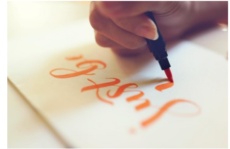
Make "circles" with your arms!